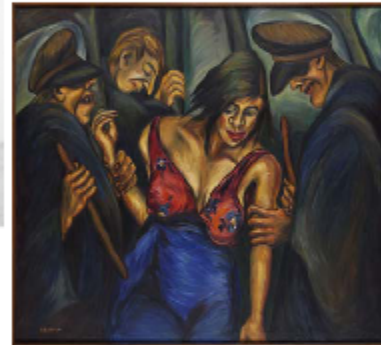
Image credit: Débora Arango (Colombia, 1907-2005) Justicia / Justice, 1944

Sociales: Débora Arango Llega Hoy / Débora Arango Arrives Today is the first exhibition of Débora Arango's work in the United States. Arango is considered the most important and controversial modern artists from Colombia. This exhibition includes the most emblematic works from every stage of her career.