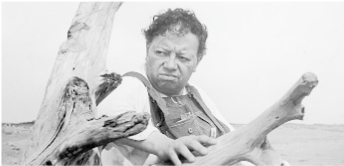
Diego Rivera, 1945

Cost: $12.00 Register now to reserve your space. Colleagues, family & friends are encouraged to attend.